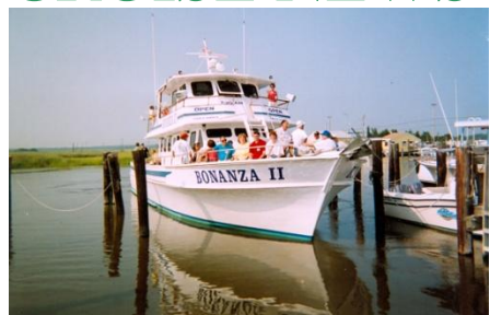
Complete Schedule on Page 8