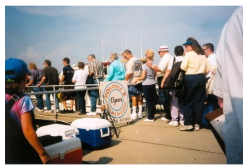
PERMISSION TO COME ABOARD GRANTED

Our dates for this year: Sundays July 11<sup>th</sup> and August 15<sup>th</sup> for the Sunset Cruises leaving the dock at 4:30 P.M. Saturdays July24th and August 28<sup>th</sup> for the Moonlight Cruises leaving the dock at 6:30 P.M. Boarding time 45 minute before cruises