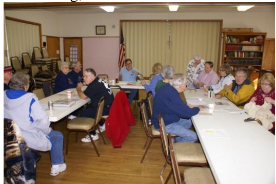
Enjoying the Meetings Fellowship

The Sea Isle Methodist Church and "Friends of the Ludlum's Beach Lighthouse, Inc. hosted the meeting and location. We enjoyed a nice fellowship prior to the meeting, coffee and donuts.